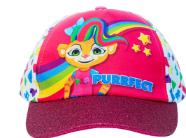
Twirl Cap $13.95

We are closing the booking deadline at 7 December in order to guarantee the items will arrive to the studio before Christmas. Please note that a "Freeze" plush is in the works but Ready Set Dance will not have stock until after Christmas.