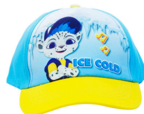
Freeze Cap $13.95