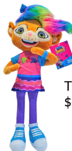
Twirl Plush $25.95