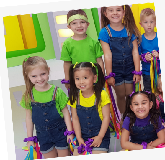
Ready Set Dance TV Show

Check out some of our pre-school students performing on the Ready Set Dance TV Show! Watch on Foxtel's Nick Jr channel, download the App or search on YouTube.